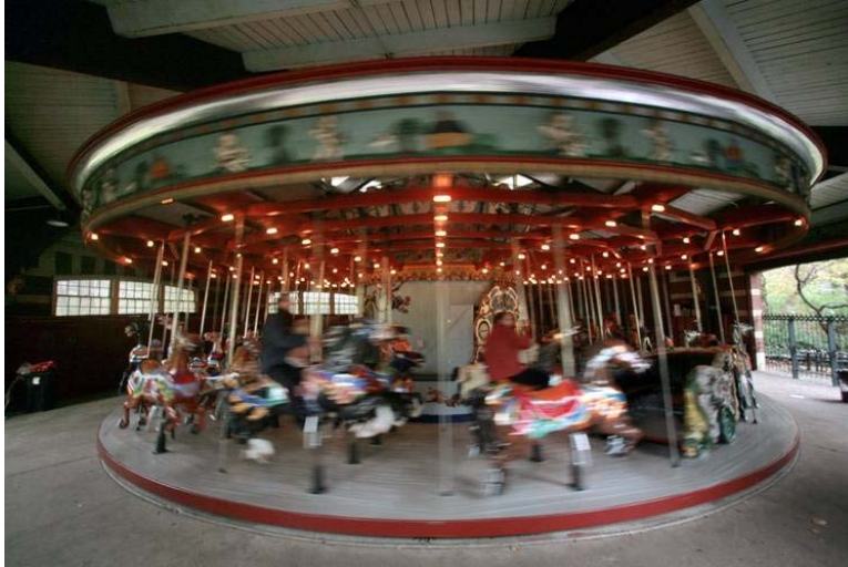
Mr. Trump signed a 10-year agreement to run the carousel in New York's Central Park.

New York's Central Park has a carousel that dates back to 1908, with brightly painted, hand-carved horses circling to calliope organ music. In 2011, Mr. Trump signed a 10-year agreement to run the carousel. The $3 admissions generated $702,961 in revenue in the 17 months through May, according to Mr. Trump's financial disclosure form filed with the Federal Election Commission.