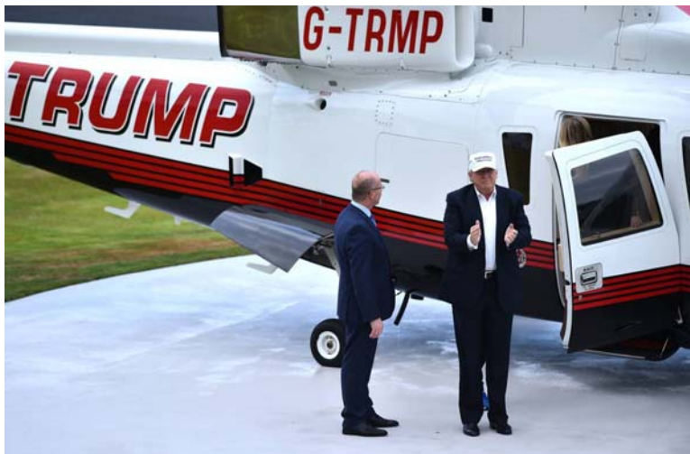
Donald Trump arrived by helicopter in June to officially open his Trump Turnberry golf resort in Ayr, Scotland, after an eight-month refurbishment.

The opacity of his holdings makes it impossible to gauge the full extent of potential conflicts he may face as president